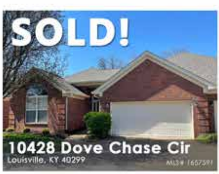
Rick Show Realtors Represented Buyers