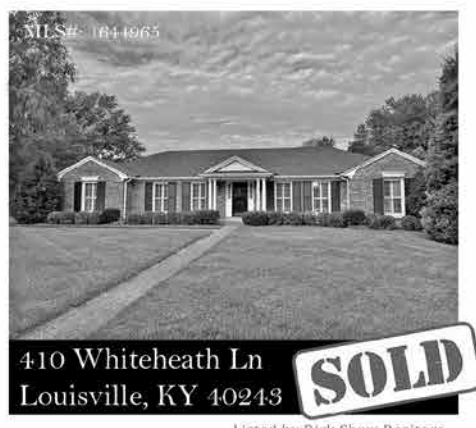
Listed by Rick Shaw Realtons