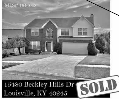
Listed by Rick Shaw Realtors