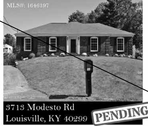
Represented the Buve