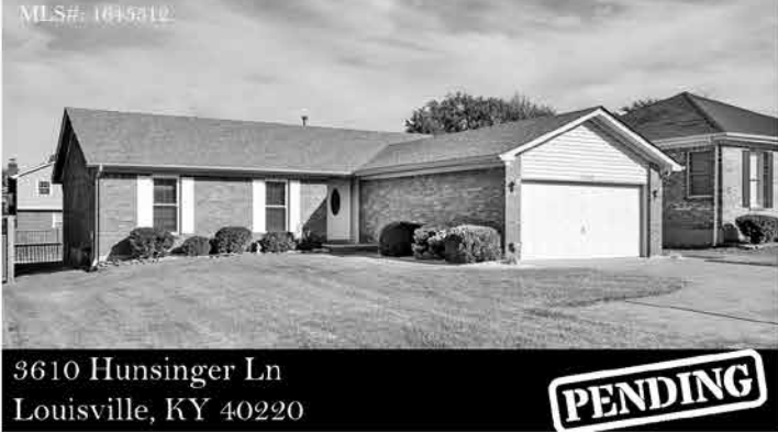
Represented the Buyer