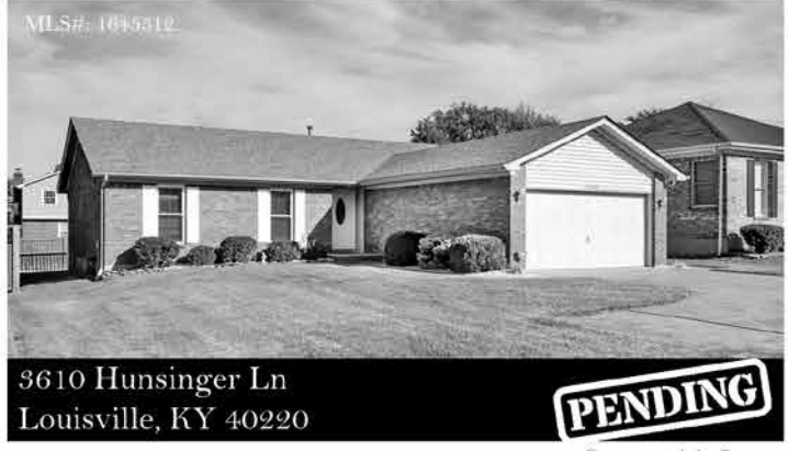
Represented the Buyer