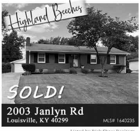
Listed by Rick Shaw Realtors