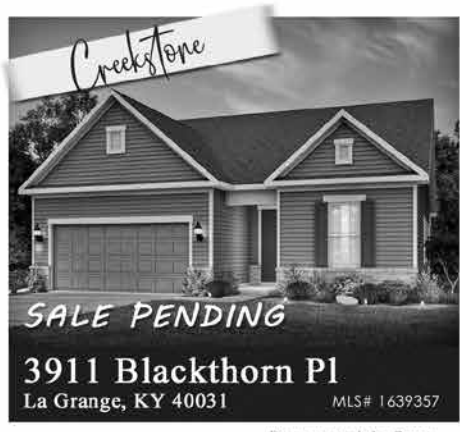
Represented the Buyer