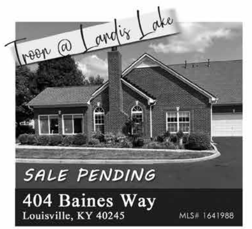
Listed by Rick Shaw Realtors

10222 Shelbyville Rd Louisville, KY 40223 (502) 245-0525 www.RickShawRealtors.com