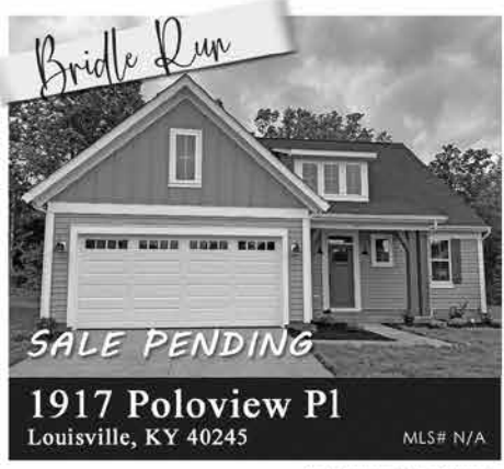
Represented the Buyer