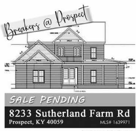
Represented the Buyer