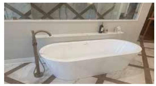
Call or Book Online Today! $35.00 Off Any Service Expiration Date 08/01/2023